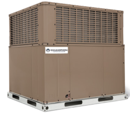
PHE6 (ELECTRIC HEAT) PHG6 (GAS HEAT)