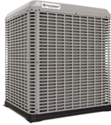
THF2 HL19 HL20 $$ $$$$